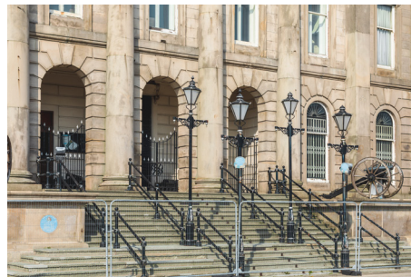
Town Hall building currently closed to the Market Square