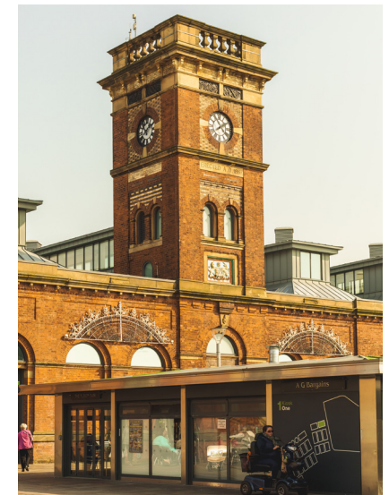
Stalls and kiosk structure block views to heritage