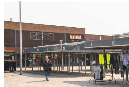
Opportunity for anti-social behaviour issues within kiosks